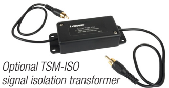
Optional TSM-ISO signal isolation transformer