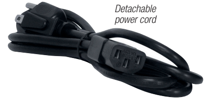
Detachable power cord