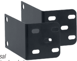
Universal mounting brackets