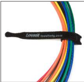
Optional velcro cable wraps (#VCW-12) help organize cables.