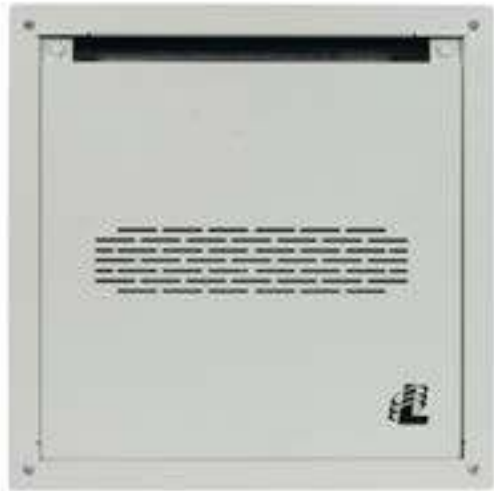
Mounted to the in-wall box, the front cover panel leaves an opening for cables.