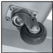
The base features casters with a specially formulated rubber tread that won't mar fine floors.