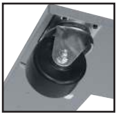
The base features 3" swivel casters