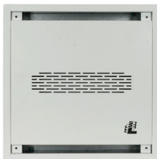
Optional cover panel