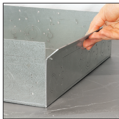
Side breakaway segments allow this box to adapt to walls shallower than 4"D.