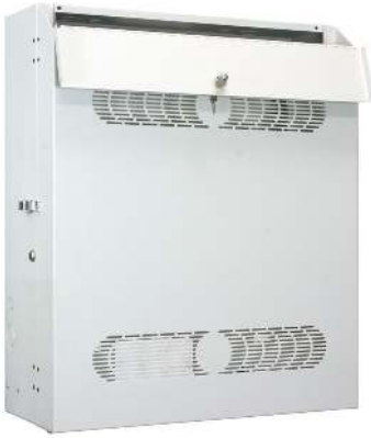
Flip-top allows access to upper bay without opening main compartment.

Wall-mount cabinet with deep door, flip top, two mounting bays 4U horizontal-mount + 6U (21"D) vertical-mount