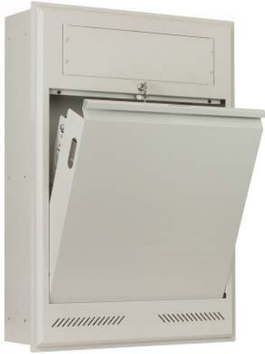
Wall-mount rack with two bays. Remove the top panel to utilize the 3U upper bay. The lower (main) bay tilts down when opening to operation or service position.

4U x 20"D tilt-out bay holds equipment vertically additional 3U panel space (above)