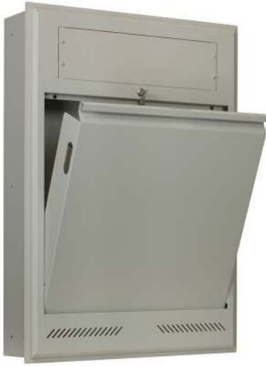
Wall-mount rack with two bays. Remove the top panel to utilize the 3U upper bay. The lower (main) bay tilts down when opening to operation or service position.

3U x 20"D tilt-out bay (holds equipment vertically) additional 3U panel space (above)