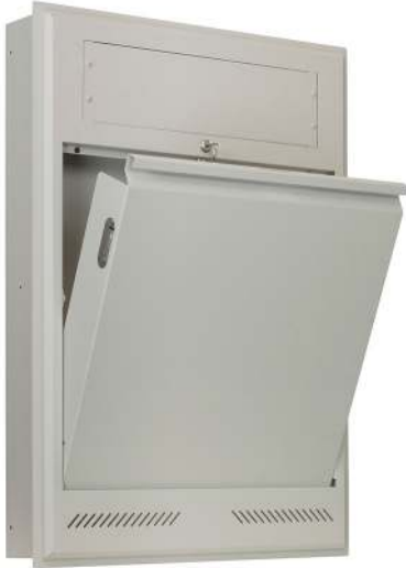
Wall-mount rack with two bays. Remove the top panel to utilize the 3U upper bay. The lower (main) bay tilts down when opening to operation or service position.

2U x 20"D tilt-out bay holds equipment vertically additional 3U panel space (above)