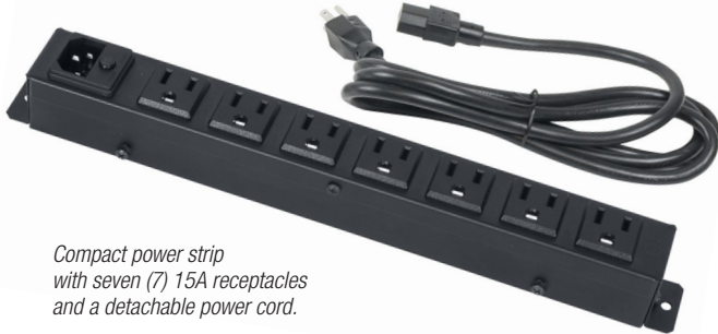
Compact power strip with seven (7) 15A receptacles and a detachable power cord.

Compact power strip provides seven 15A NEMA receptacles in a 12" low profile chassis that features integral mounting "ears" at both ends. This power strip is also designed to mount to rear notches in rackmount utility shelves (noted below).