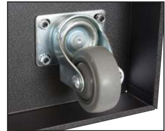
Fine floor caster