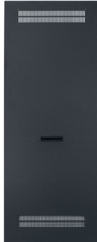
Side panels have top/bottom vents and integral handle.

The rack shall include a pair of removable side panels Model No. _____, which shall be 18-gauge certified U.S. steel with integral handles. Finish shall be black wrinkle powder epoxy.