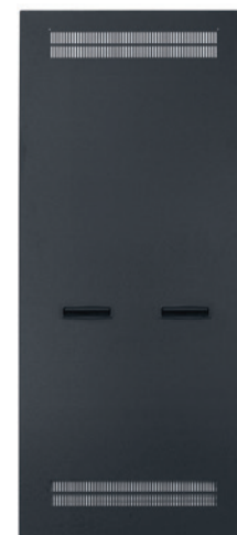
Model No's. SDV-3026, SDV-3826 and SDV-4426 have two integral handles.