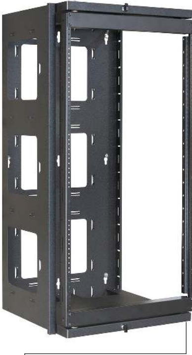
Gate swings open from a fully open side, which gives you extraordinary access to equipment and cables.