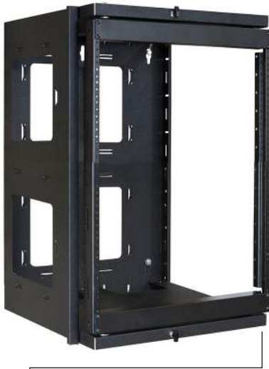
Gate swings open from a fully open side, which gives you extraordinary access to equipment and cables.