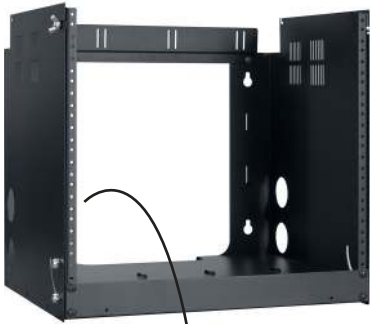
Front frame pivots down for access