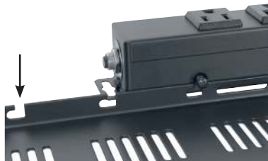
Notches on the shelf's rear flange make it easy to mount a 12" power strip (see options).