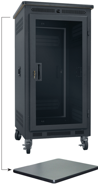
The LPR--PGT Series rack includes a 1"H premium Graphite Grey laminate top with rubber edge molding, which attaches to (and hangs over) the rack's standard steel top.