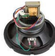
Includes 8" 50W coaxial driver and mounted 70V transformer