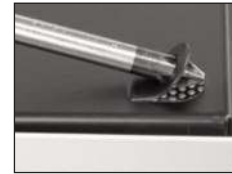
Features four restraint tabs for code compliance. Use the tip of a screwdriver to bend the tab out for tie-offs.