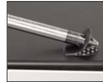
Assembly is fabricated with four restraint tabs for code compliance. Use the tip of a screwdriver to bend the tab out for tie-offs.