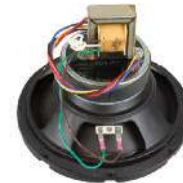
Mounted driver and transformer

Assembly is fabricated with a restraint tab in one corner and a hole in the diagonally opposite corner for (two cable) code compliance. Use the tip of a screwdriver to bend the tab out for tie-offs.