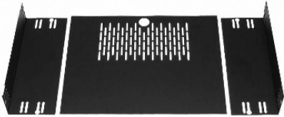
Three piece shelf can be installed to emulate 2U or 3U panel space.