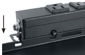
Notches on the shelf's rear flange make it easy to mount a 12" power strip (see options).