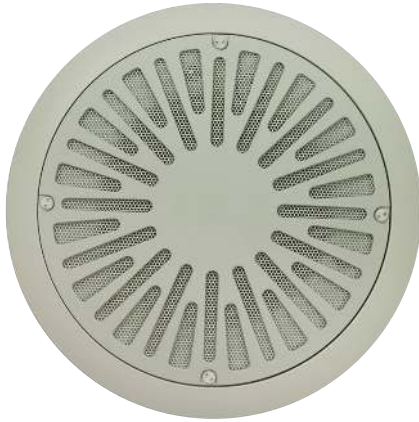
LUH-VRG mounted to a recessed Unihorn (with the horn's trim ring in place).