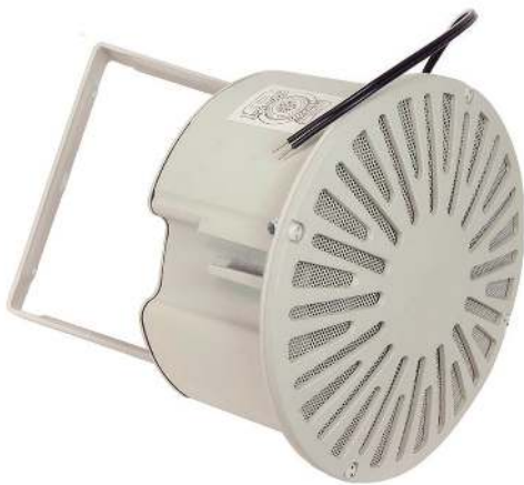
LUH-VRG mounted directly to a Unihorn (without a trim ring) plus optional U-bracket #LUH-BRKT for surface-mount.