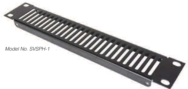
Model No. SVSPH-1

The rackmount panel shall be Lowell Model No. _____, which shall measure 10.4 inches wide x _____ (one or two) rack units and have a 0.5 inch flange. The panel shall feature front slots for passive ventilation. It shall be made in the USA with certified US steel and have a black semi-gloss powder epoxy finish.