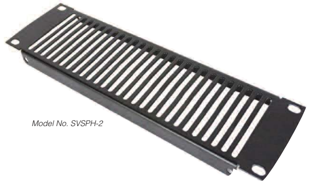
Model No. SVSPH-2