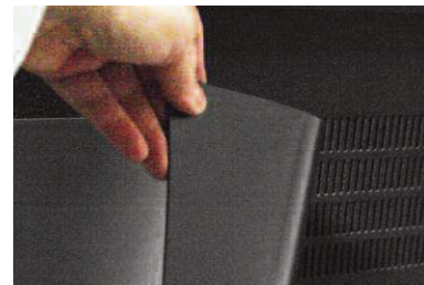
Magnetic vent blockers are typically installed inside the rack to cover vents near the top of the rack. When a fan panel is installed in the rack top, air can be drawn through (open) vents at the bottom, past the covered vents and exhaust through the fan panel.