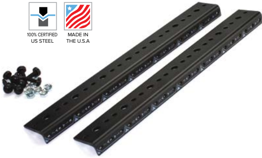
RRTF series rails are tapped to accept threaded 10-32 screws (RRTF-7 shown).