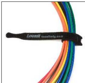
Optional velcro cable wraps (#VCW-12) help organize cables.