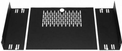
Three piece shelf can be installed to emulate 2U or 3U panel space.