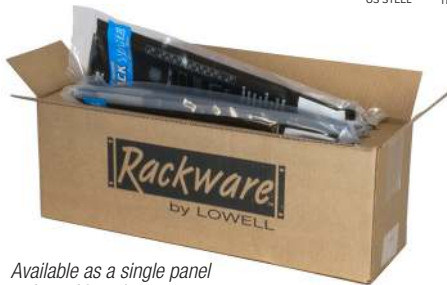
Available as a single panel or in multi-pack cartons.