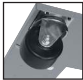
The base features 3" swivel casters