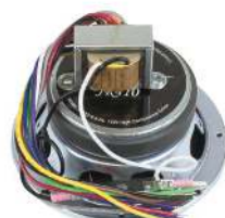
Mounted driver with factory-wired transformer.

Assembly is fabricated with a hole in one corner and restraint tab in the diagonally opposite corner for (two cable) code compliance. Use the tip of a screwdriver to bend the tab out for tie-offs.