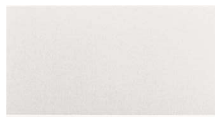
Fine perforation pattern grille.

ured 1W/1M. The system shall include a factory-mounted dual voltage (70/25V) transformer with primary taps at 0.25, 0.5, 1, 2, and 5W and a 0.147 cu.ft. steel backbox with black powder epoxy finish. Speaker connections shall exit the enclosure through a metal clamp.