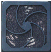
Optional: Fan filter, model FW-FF.