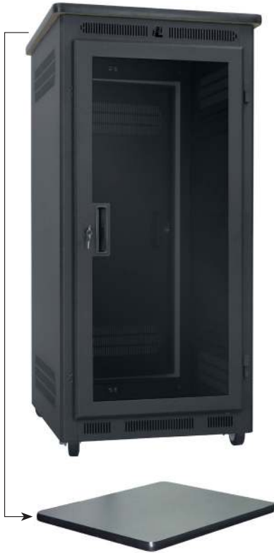
Includes a Graphite Grey laminate top with rubber edge molding, which attaches to (and hangs over) the rack's steel top.