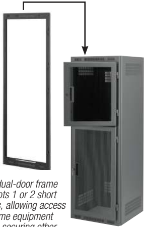
The dual-door frame accepts 1 or 2 short doors, allowing access to some equipment while securing other electronics.

Mounts 1 or 2 short rack doors to control access to equipment