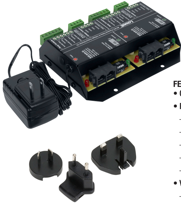
Relays include an attached power supply with NEMA 1-15 plug, plus three adaptors for use in areas outside North America.